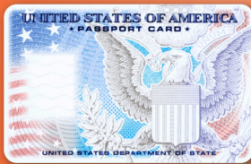
U.S. Passport Card