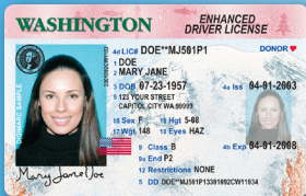
Enhanced Driver's License